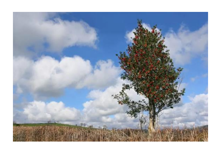
The Holly Tree Birth Tree for July

"Tears of joy are like the summer rain drops pierced by sunbeams."