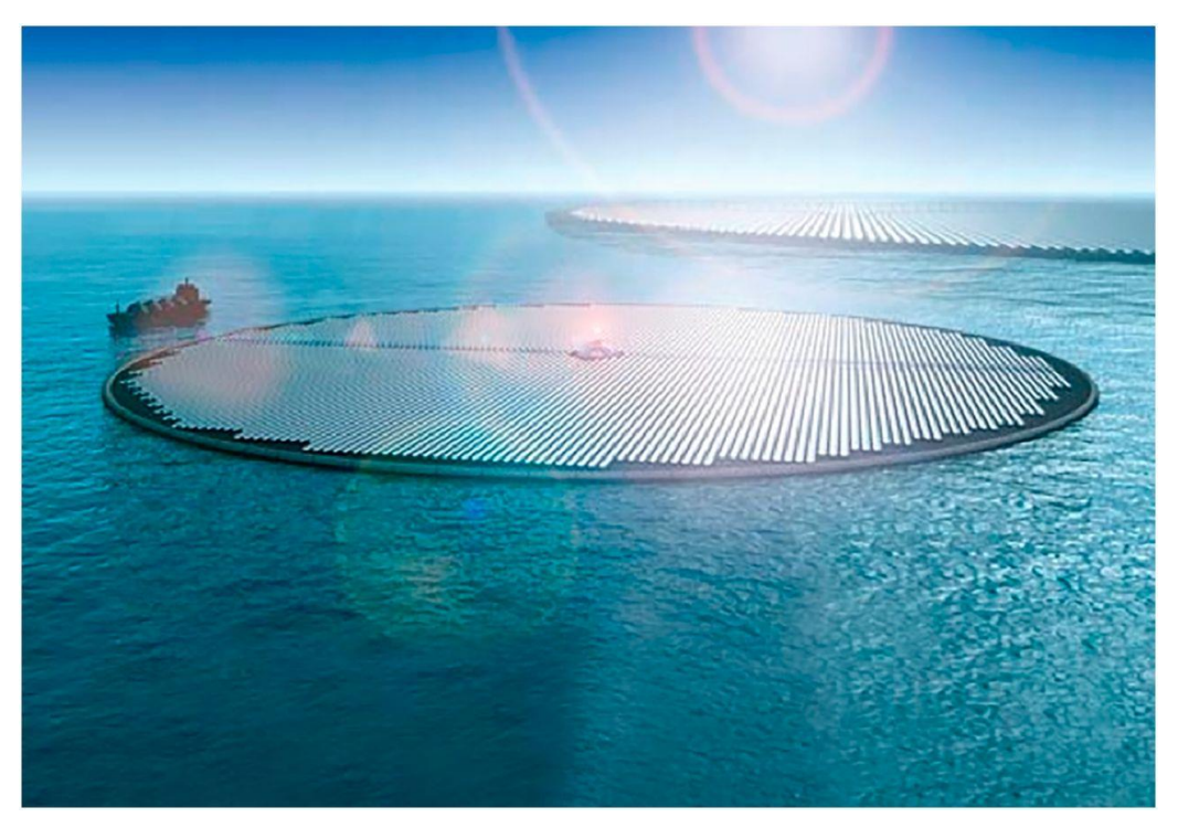
PNAS: Proceedings of the National Academy of Sciences

The Chalice full moon drum circle is Monday, July 3 from 7:30 to 8:30 p.m. outdoors at Chalice. What to expect? Not necessarily the moon. But it's all about the people and the rhythm. Bring instruments or borrow ours. Spend an hour outdoors in the magic of a summer evening.