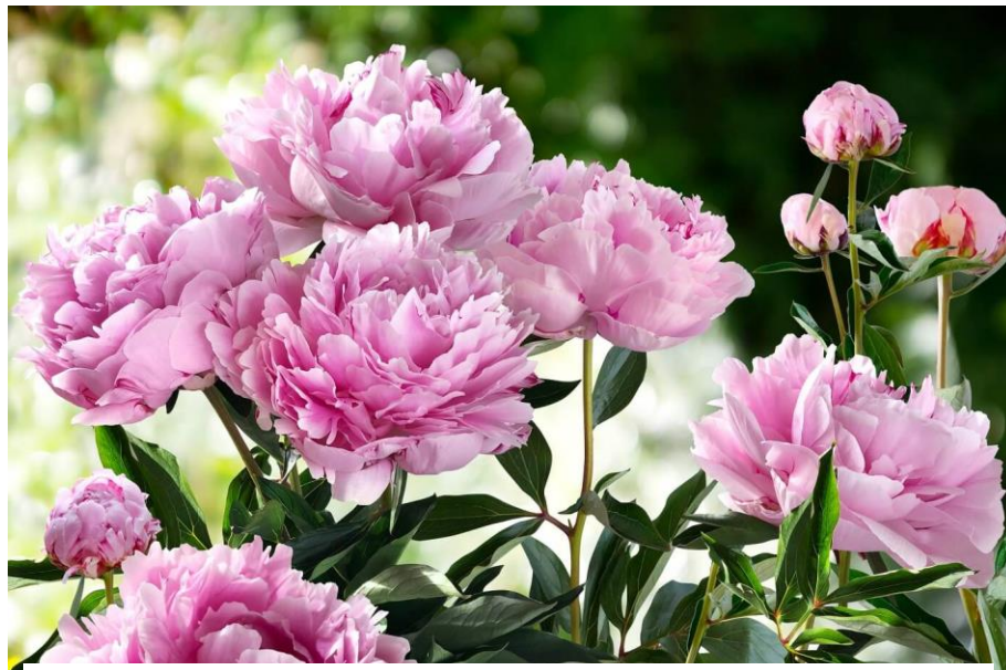
Peony—another flower of November