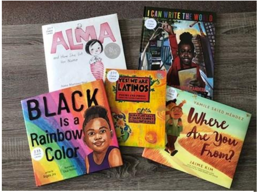
The Chalice library has new books written by Black, Indigenous, and People of Color (BIPOC) authors.