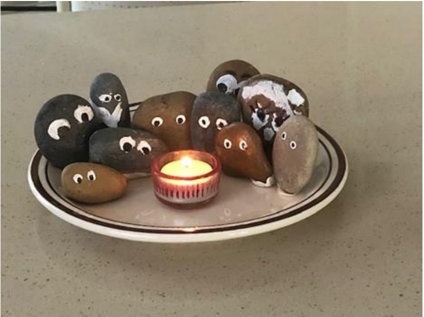
A new type of chalice for the chalice lighting at the beginning of each class