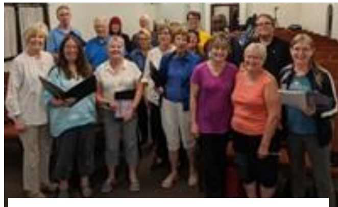
Chancel Choir from 2019

The Chalice Chancel Choir will be able to return to in-person rehearsals starting Thursday, August 19 at 6:15p. The rehearsals will take place outside on the patio until September 2, when we expect to move to the Rainbow Room in the Hub. After moving indoors, the choir will return to the regular Thursday rehearsal schedule from 7:30p to 9:30p. For now, all choir participants must be fully vaccinated. As our season begins, the Chancel Choir will not sing live during Sunday services, but will pre-record musical selections on Thursday evenings in advance for Sunday service. If you are interested in singing in the choir, please email music@chaliceucongregation.org for more detailed information. It will be wonderful to make music together again!