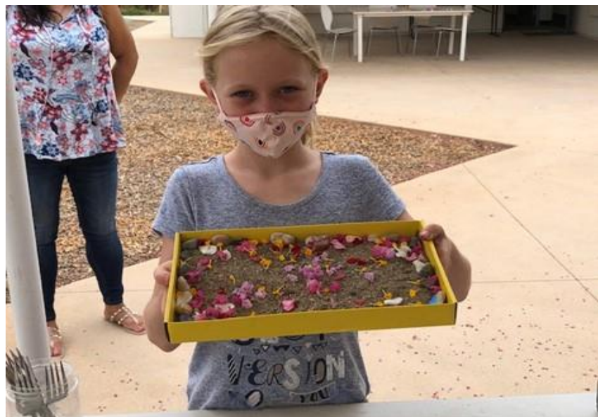
Everyone made Zen Rock Gardens in class