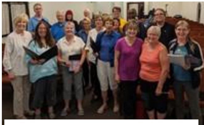
Chancel Choir from 2019

The Chalice Chancel Choir will be able to return to in-person rehearsals starting Thursday, August 19 at 6:15p. The rehearsals will take place outside on the patio until September 2, when we expect to move to the Rainbow Room in the Hub. After moving indoors, the choir will return to the regular Thursday rehearsal schedule from 7:30p to 9:30p. For now, all choir participants must be fully vaccinated. As our season begins, the Chancel Choir will not sing live during Sunday services, but will pre-record musical selections on Thursday evenings in advance for Sunday service. If you are interested in singing in the choir, please email music@chaliceucongregation.org for more detailed information. It will be wonderful to make music together again!