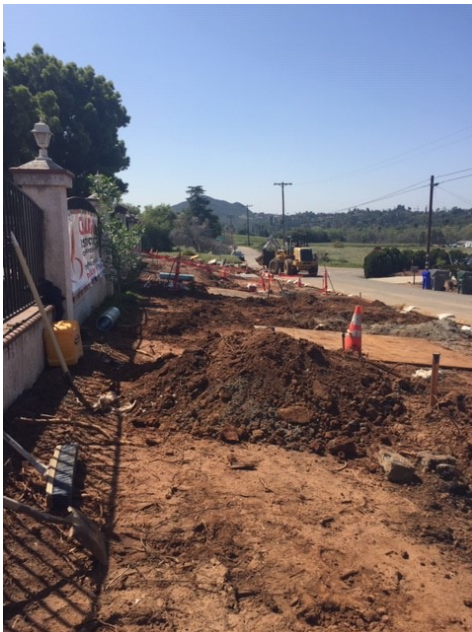
The front of Chalice