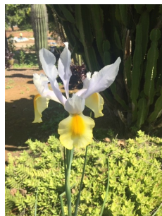
An Iris in the cactus garden - beauty & hope amid the chaos.

They say a picture is worth a thousand words.