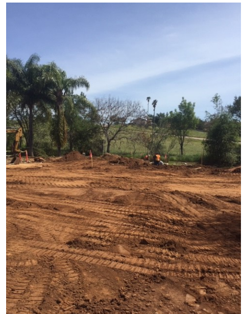
The back of Chalice