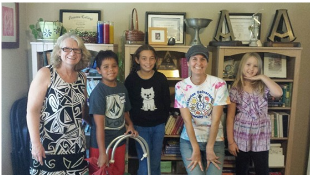
4th & 5th Grade Class