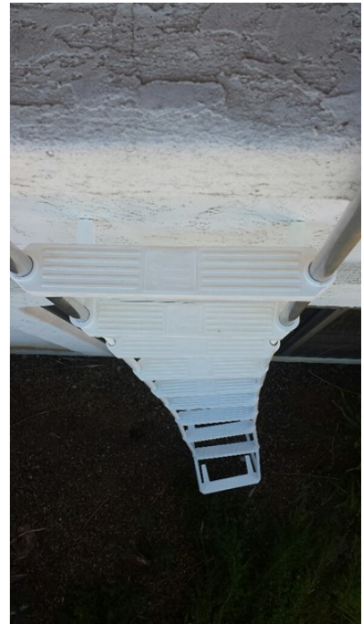
Fire Escape Ladder Deployed