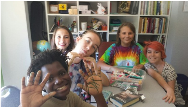
Middle School Class

Our 4 th /5 th grade class and our Middle School class meet each Sunday morning in the upstairs offices. So the first day of classes this fall, they were trained in what to do in case of a fire. Their training included practice in deploying the fire ladder.