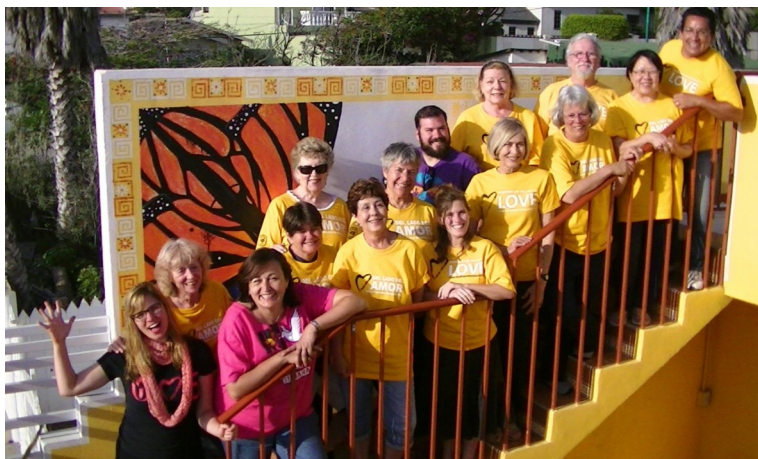
Group at the Garymar Academy